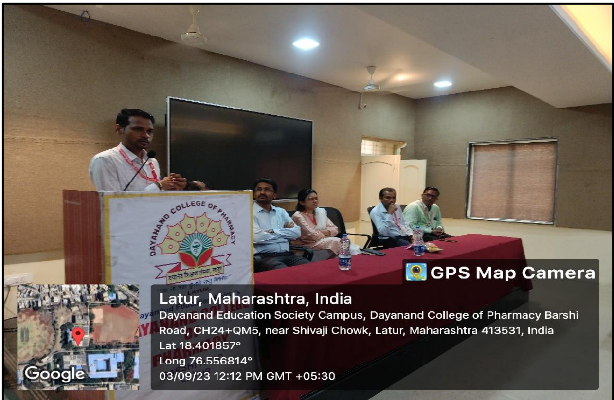
Pre-placement talk given by HR Manager in Seminar Hall of DCOP Latur