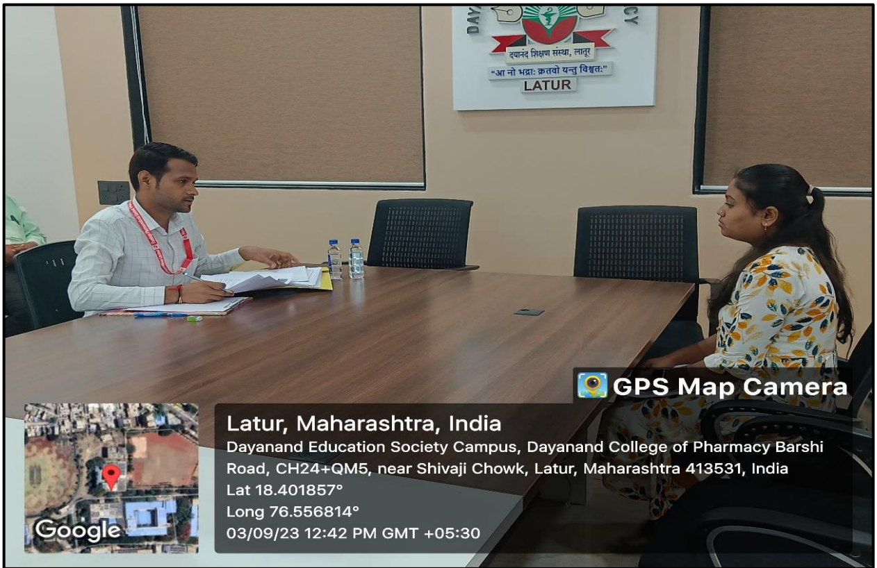
HR Manager taking the interview of Candidate in Seminar Hall